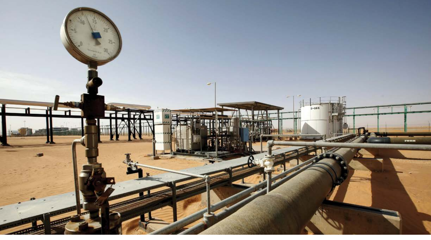
The El Sharara oil field in southern Libya is operated by the National Oil Corporation in a joint venture with several European oil companies. At normal production, it pumps around three hundred thousand barrels of crude oil per day.