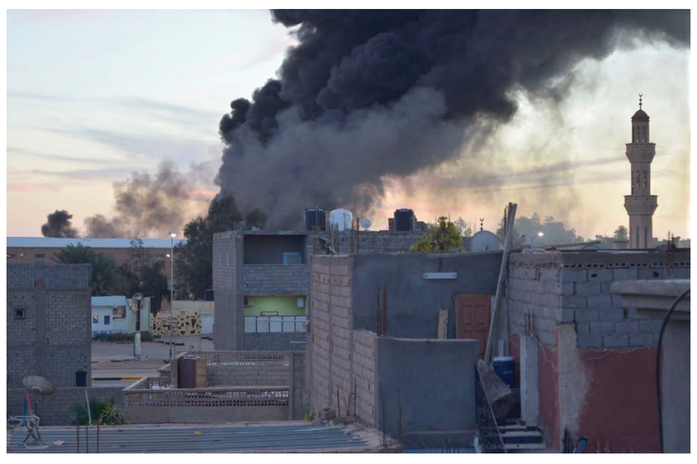
Black smoke billows from buildings in Sebha, the largest city in southern Libya, on January 17, 2014, following several days of clashes between rival militias and ethnic groups.

post-Gadhafi trajectory has been turbulent and marked by episodes of communal violence. Specific neighborhoods are often associated with a particular tribe, ethnic group, or faction. In 2019, forces loyal to Khalifa Haftar—a mix of both local allies and armed groups deployed from eastern Libya—took control of Sebha as part of Haftar's push into the south. Home to Fezzan's only university (which also has satellite campuses in Ubari, Murzuq, Brak, and Ghat), Sebha has seen its infrastructure crumble in recent years. Its airport, key to keeping the region connected, was closed between 2014 and 2019 because of poor security, and its operations remain limited. Some of Fezzan's most active CSOs are based in Sebha.