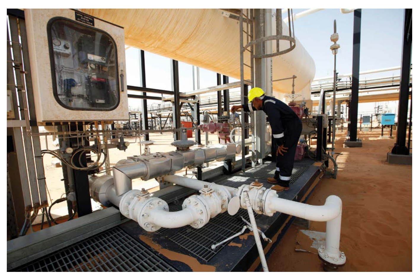
A worker checks pipes and valves at El Sharara, Libya's largest oil field, on December 3, 2014.

Respondents who did not oppose using sabotage insisted that there was no other way to voice the grievances of the south. "It's the only means of pressure we have to achieve our demands," said a female teacher in Sebha, a sentiment echoed by a female doctor in Ubari. "We have no other way to express our rights and make sure our voice is heard," said a male student from Murzuq.