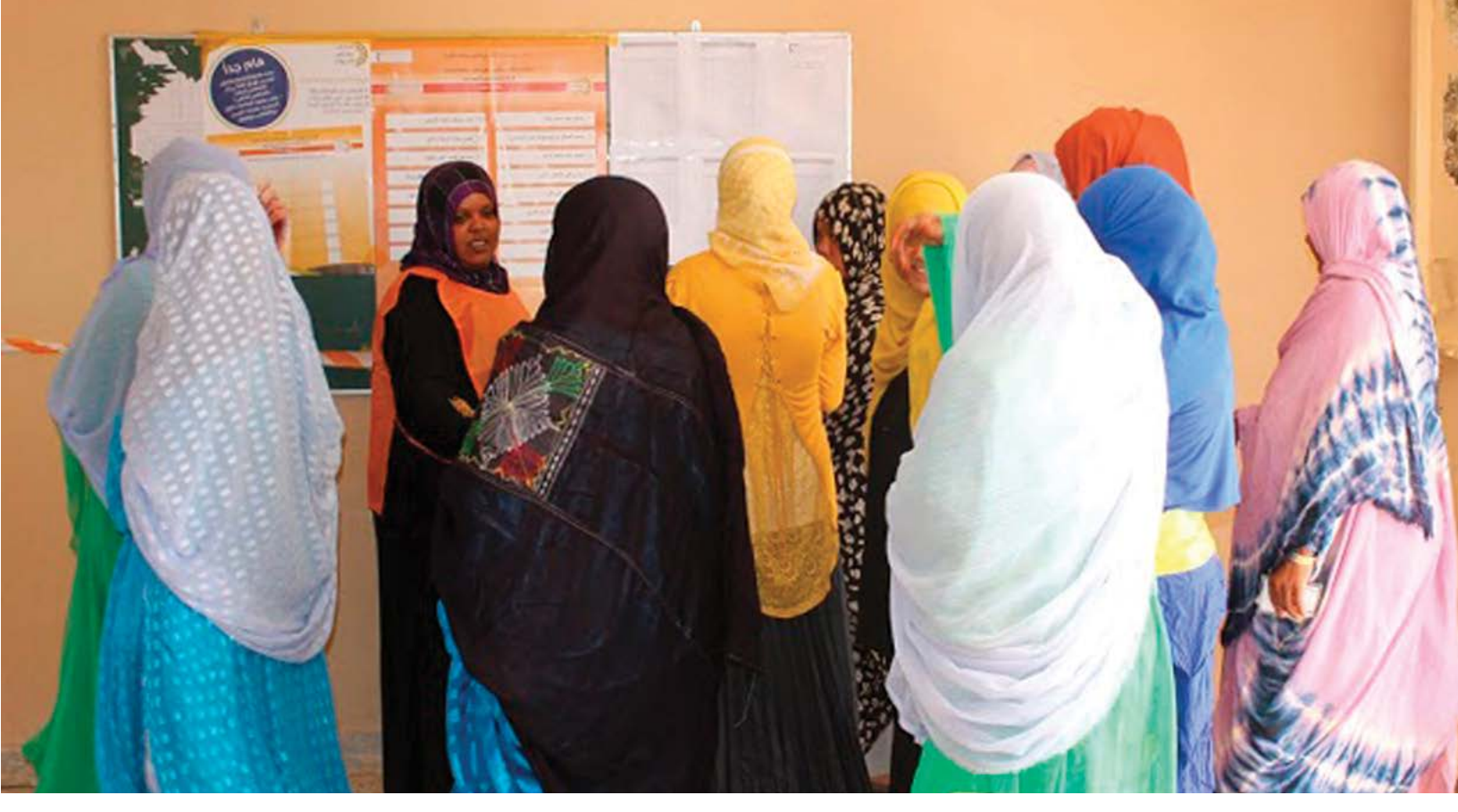
Tuareg women gather to vote in a school that serves as a polling station in Ghat, Libya, on June 25, 2014. Ghat has become economically isolated since the closure of the Algerian border.